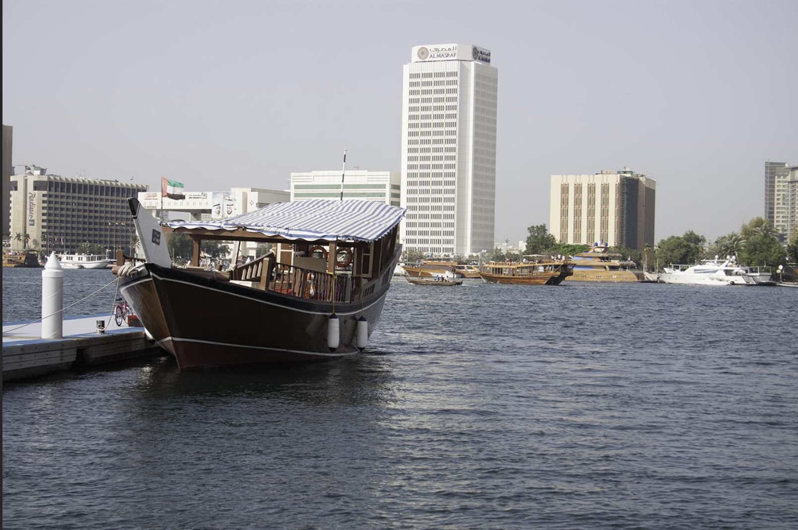
‘Dubai’ –Peter Lord