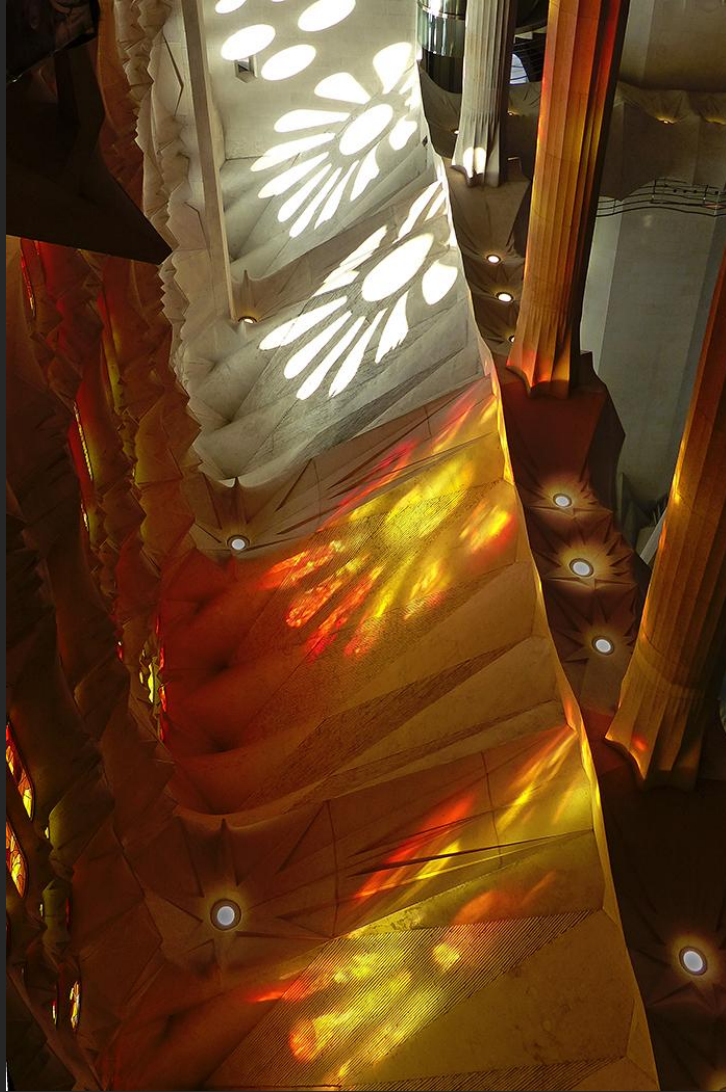
‘Sagrada Family Ceiling’