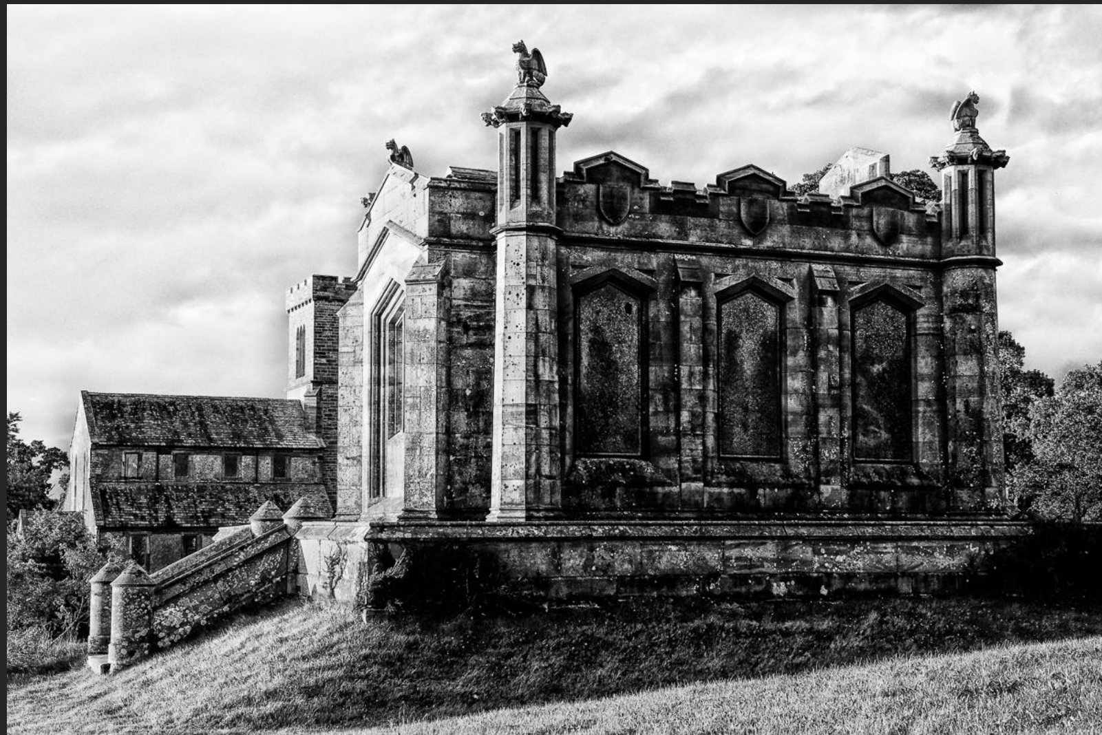
‘Old Buildings’ – Peter Minihan