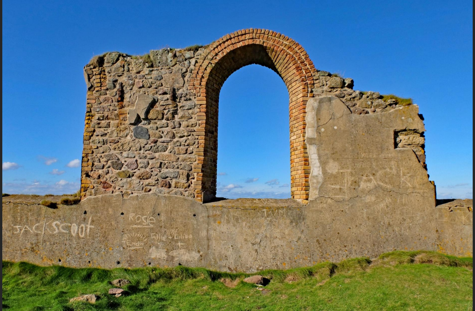
‘Jack’s View!’ – Ruth Griffiths