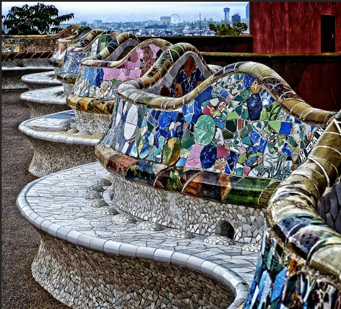
‘Park Güell Mosaic Seats’