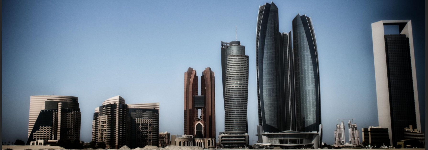
2 nd : 'Modern Times' – Jane Nelson