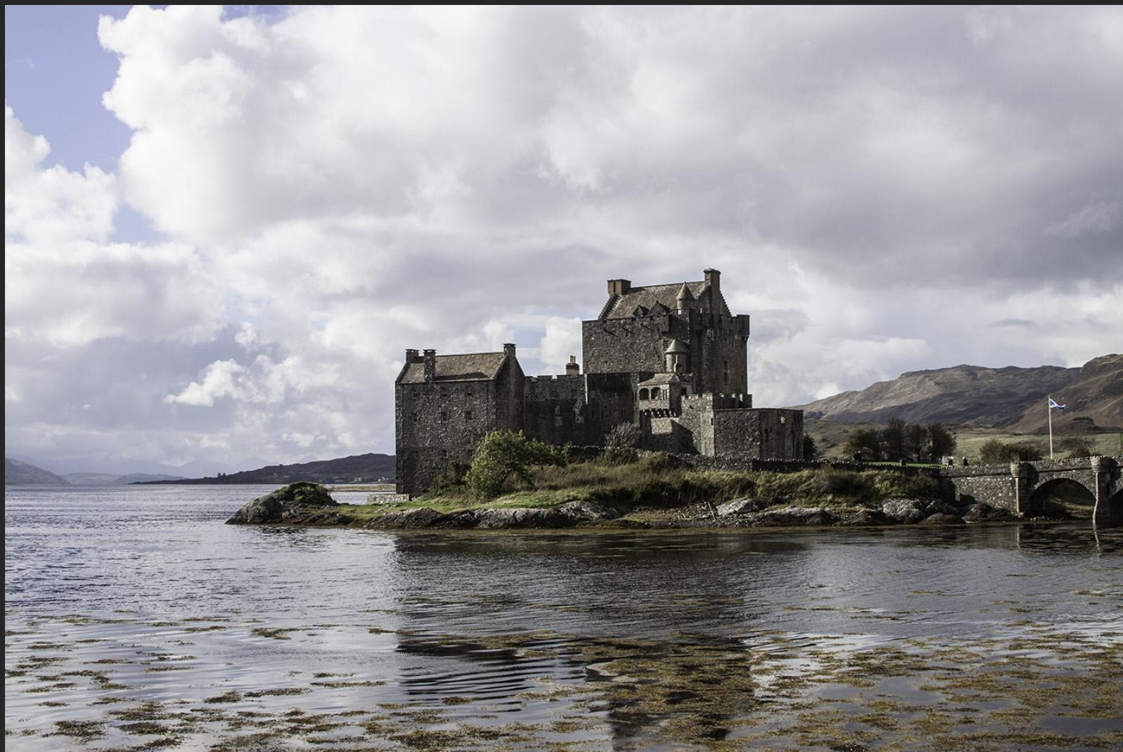
Joint 3 rd : 'Eileen Donnan Castle'