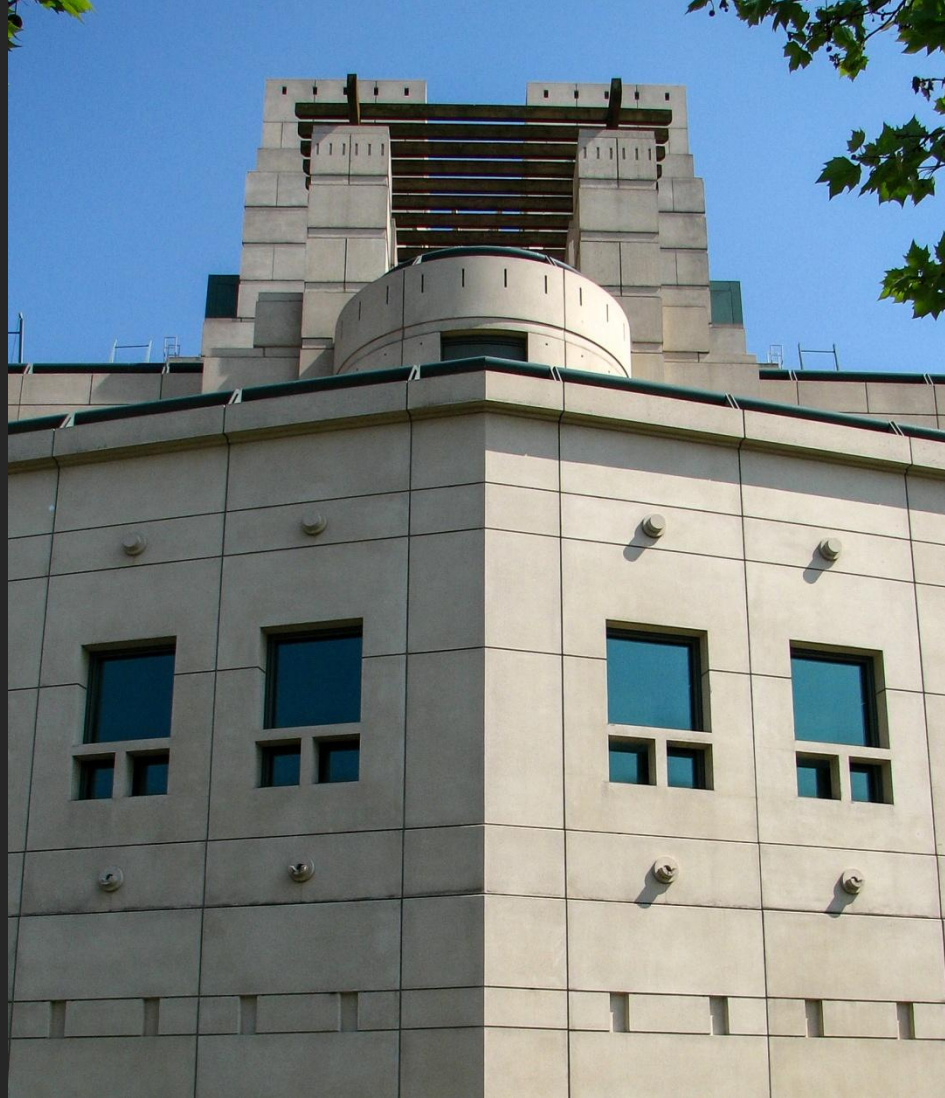
Joint 3 rd : 'MI6' – Barrie Blenkinship