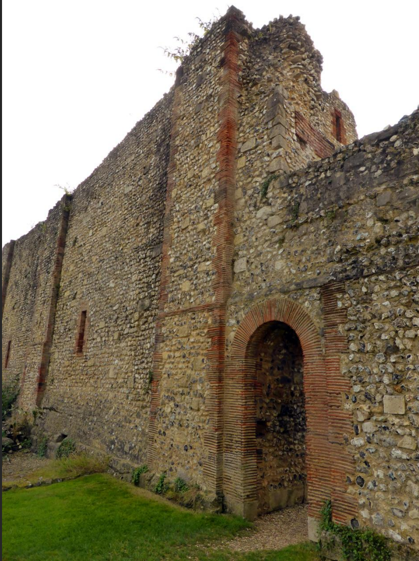
‘Old Bishop’s Palace’