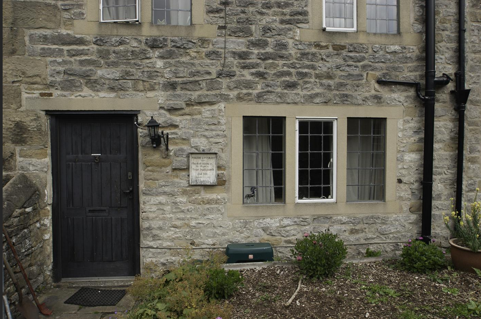
‘Plague Cottage in Enam’ – Peter Lord