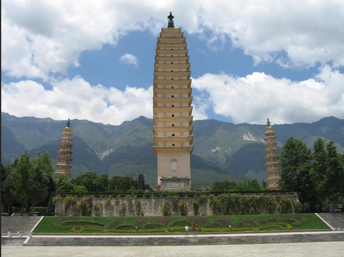
‘Three Pillar Pagoda, China’