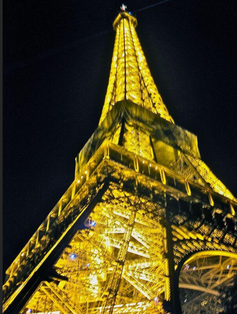
‘Tower of Light’ – Katie Brookes