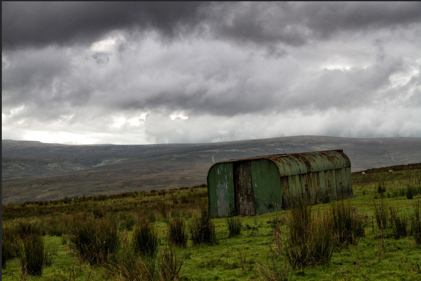
‘Old Metal Sheep Shed’ – Jill Eastham