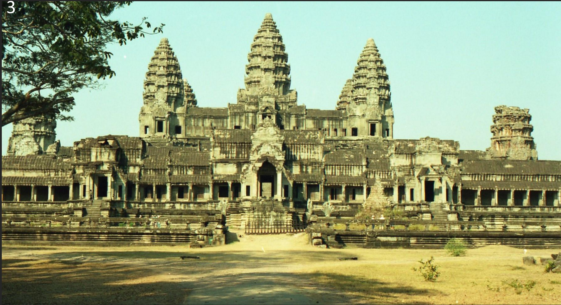
‘Anchor Wat, Cambodia’