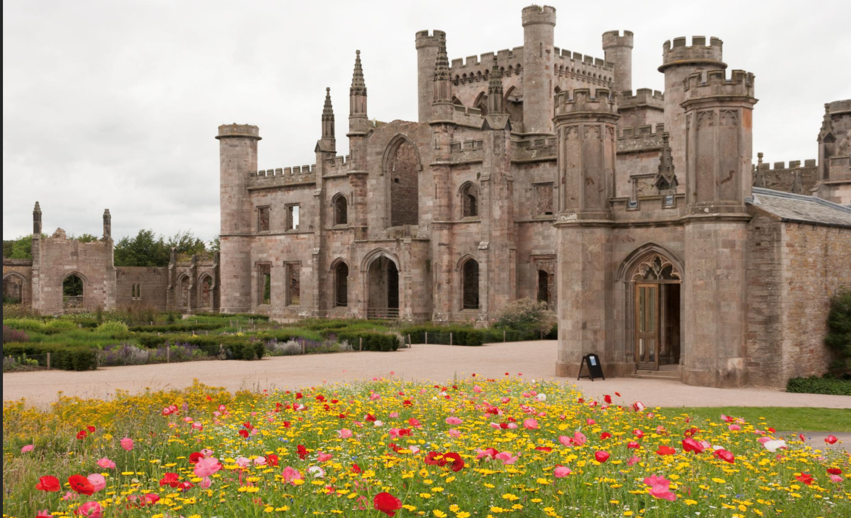
‘Lowther Castle’