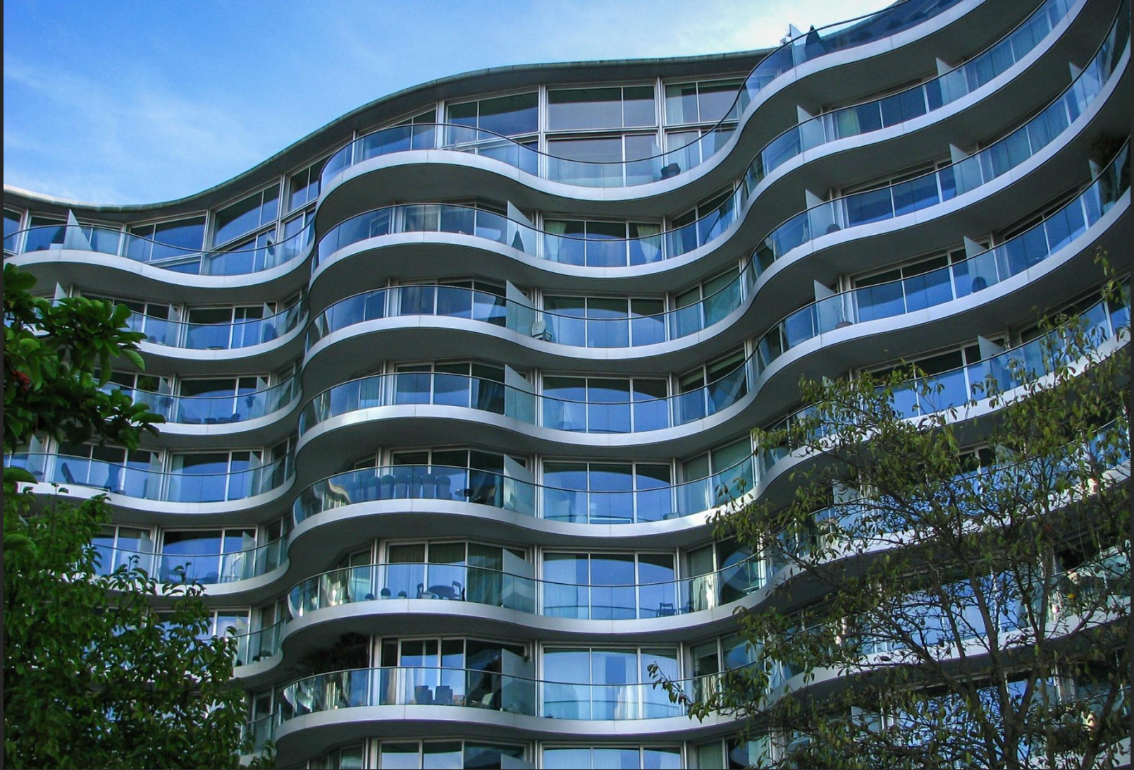
Joint 3 rd : 'Thames Side Living' – Barrie Blenkinsip