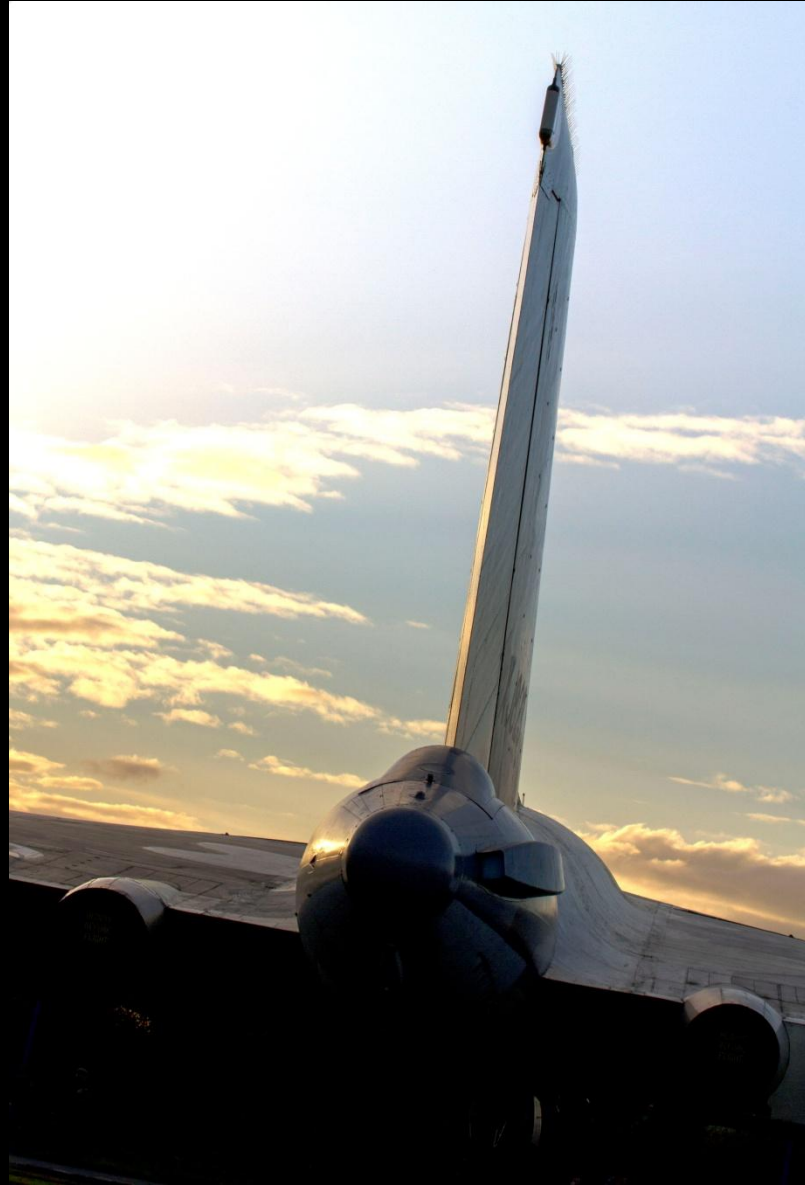
‘Vulcan- Solway Aviation Museum’ by Jill Eastham