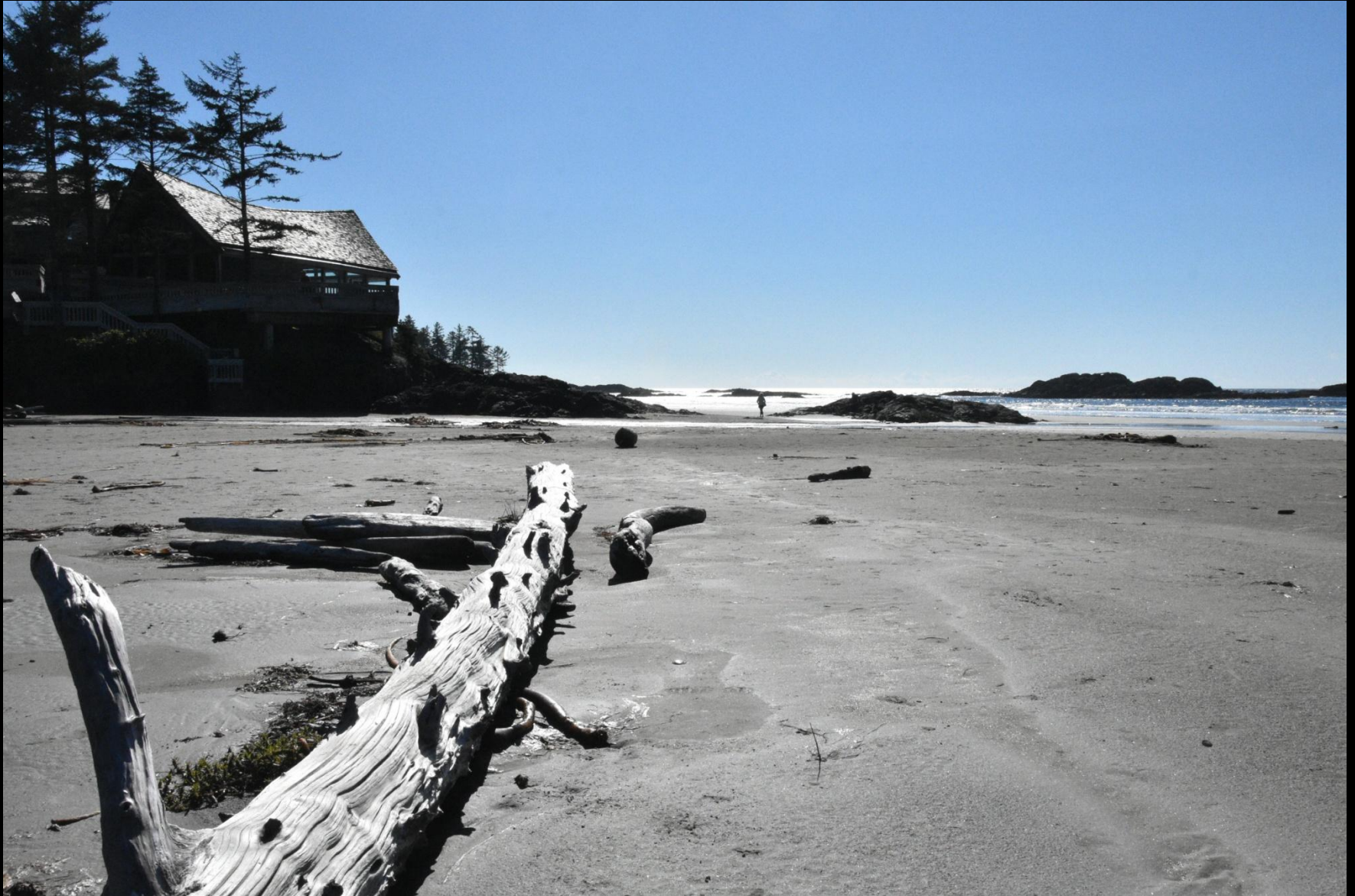
‘Driftwood Twilight’ by Colin Bryce