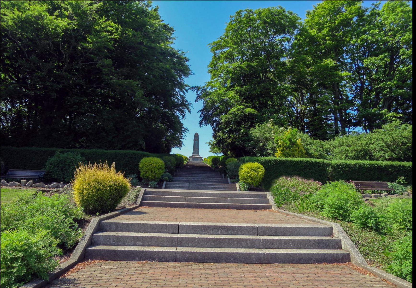
‘ Barrow War Memorial’