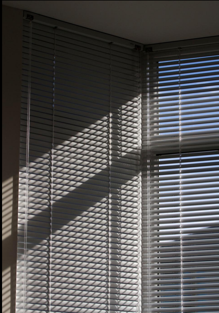
‘Light & Shadows’ by Jill Eastham