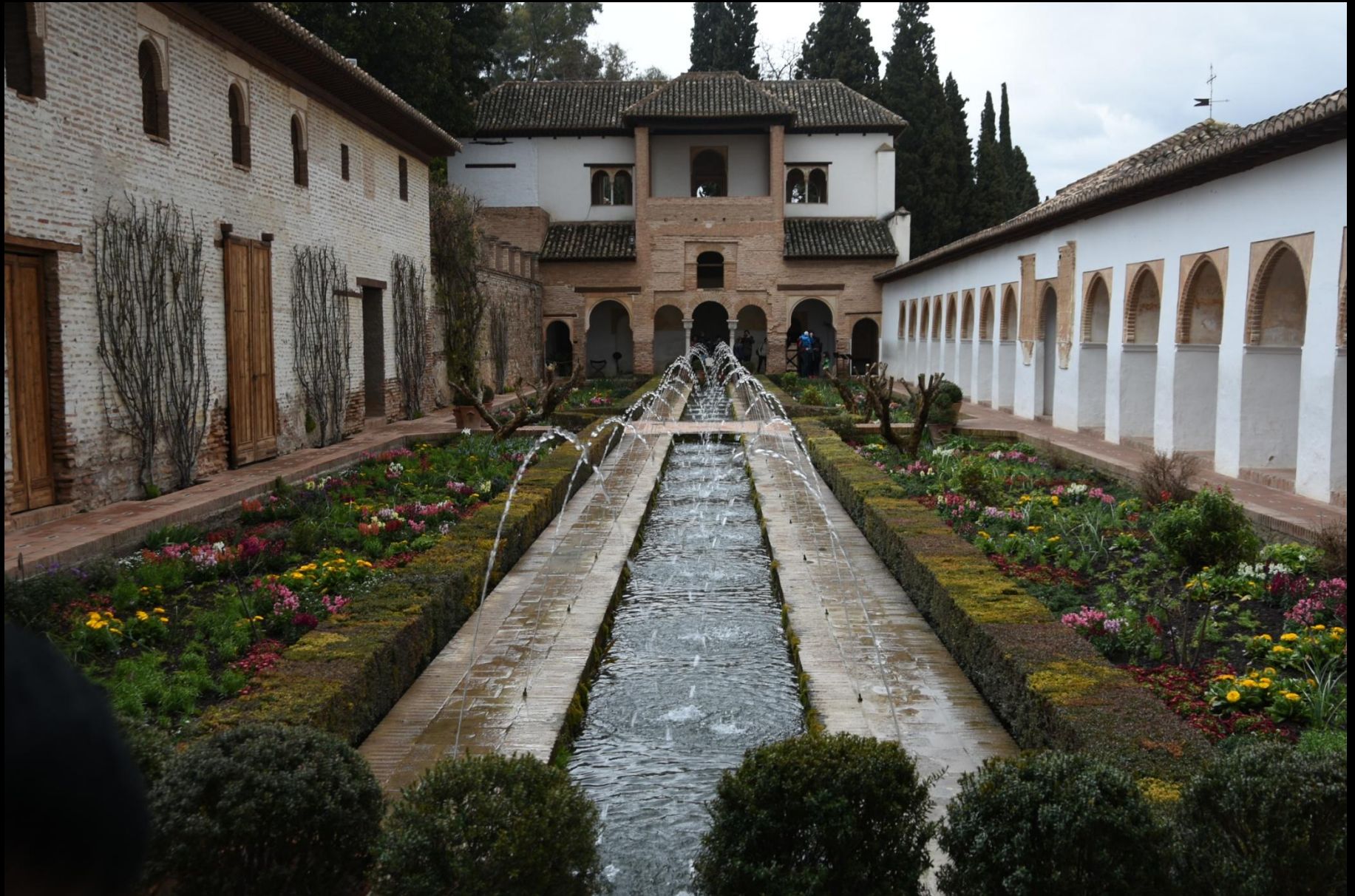
'Paradise Gardens, Grenada ' by Colin Bryce